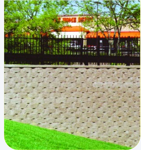
The Home Depot – Franklin, TN

Contact Pinnacle Design/Build Group at 770-205-4088.